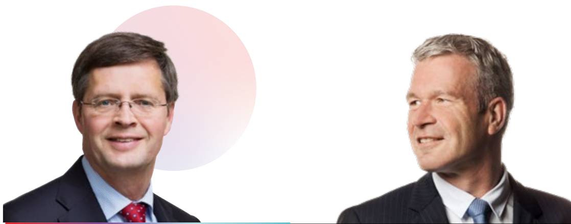
Prof Dr. J.P. (Jan Peter) Balkenende