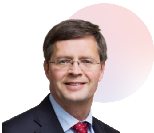
Prof Dr. J.P. (Jan Peter) Balkenende

Chairman Board Noaber Foundation and Noaber Ventures B.V. from September 20-2018