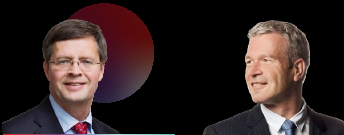
Prof Dr. J.P. (Jan Peter) Balkenende