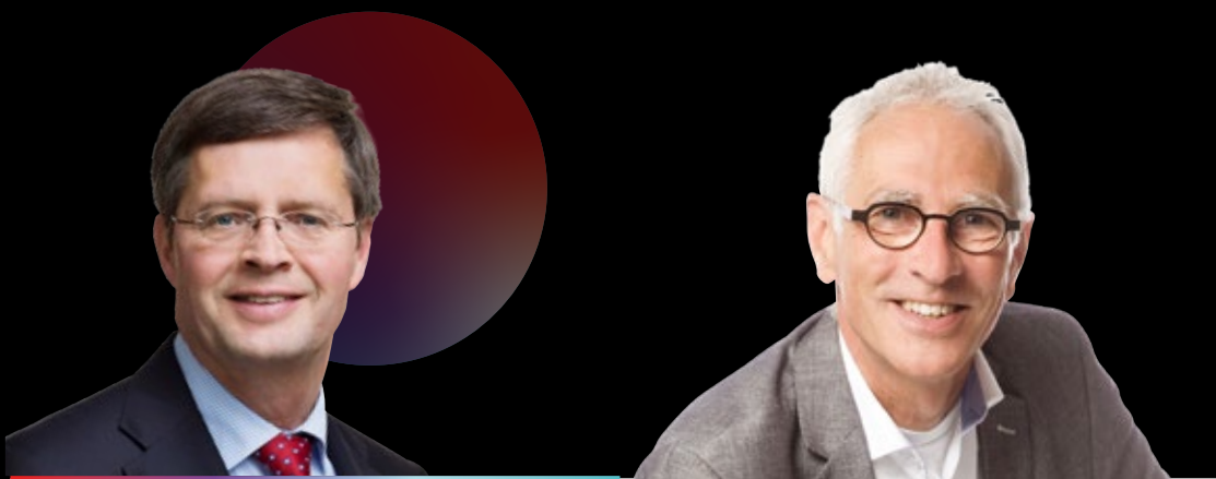
Prof Dr. J.P. (Jan Peter) Balkenende

Chairman Board Noaber Foundation and Noaber Ventures B.V. from September 20-2018